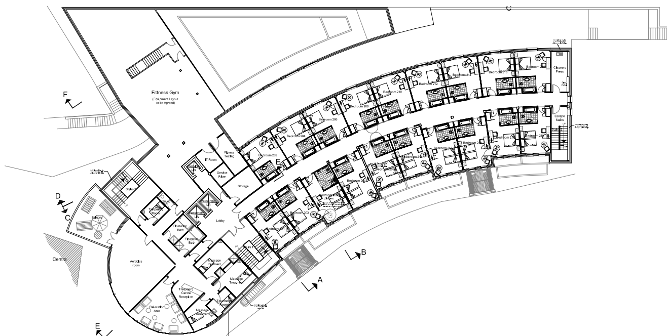
second floor plan